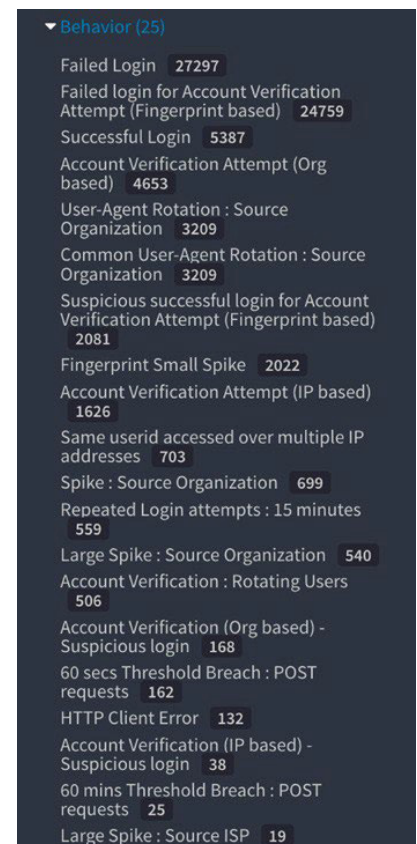
Example of rules triggering for a request highlighting behavioral heuristics

Attackers need user accounts – either legitimate and compromised or fake– to carry out attacks. The credentials detection pillar focuses on how credentials are used in automated attacks. This helps identify techniques and patterns used across requests that could indicate credential abuse or iteration using stolen credentials from well-known data breaches. It also helps identify large-scale manual fake account creation to uncover patterns that may expose bad actors' intent.